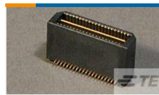
TE Part # 3-1658465-1 MSB0.80PL11ASY28DP,GP,30,VCTY