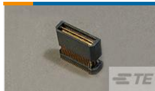
TE Part # 3-1658467-1 MSB0.80PL19ASY28DP,GP,30,VCTY