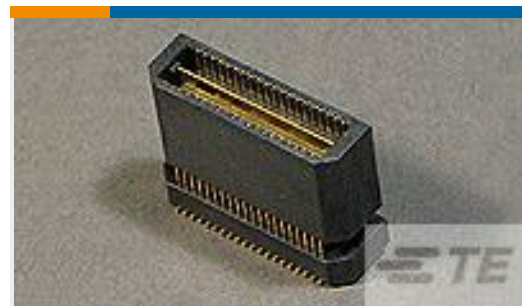
TE Part # 3-1658466-1 MSB0.80PL16ASY28DP,GP,30,VCTY