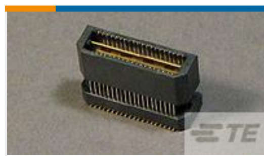
TE Part # 3-1658439-1 MSB0.80PL14ASY28DP,GP,30,VCTY