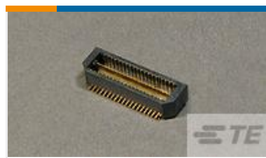
TE Part # 3-1658463-1 MSB0.80PL5ASY28DP,GP,30,VCTY