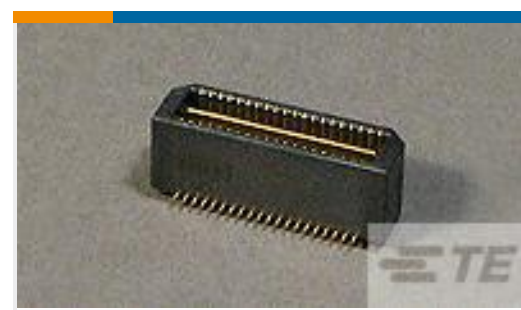
TE Part # 3-1658464-1 MSB0.80PL8ASY28DP,GP,30,VCTY