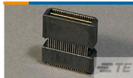
TE Part # 3-1658468-1 MSB0.80PL22ASY28DP,GP,30,VCTY